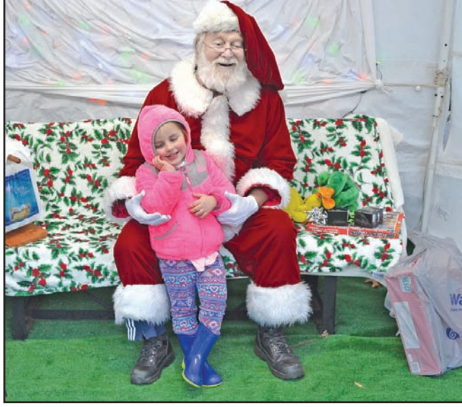
Santa Claus poses with a youngster at Vogel State Park.

To combat all the cold, Vogel broke out the metal bonfire bins, which only a couple of weeks back would