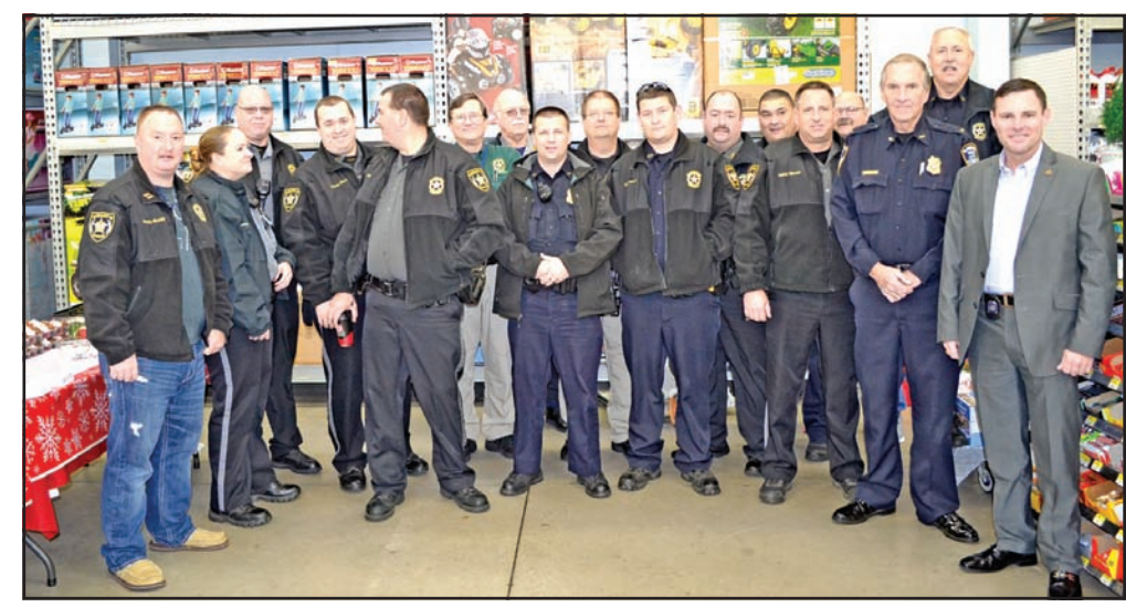
Blairsville Police Department got help from the Union County Sheriff's Office, the Blairsville Cruisers and friends.