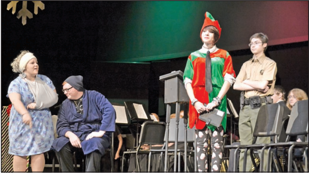
UCHS students held a trial after grandma got into an accident involving a reindeer.